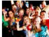
SnapShots Candid Photographs All nite long During Your Reception