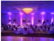
Accent UpLighting To Make your Reception Venue a Magical place!