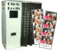
Unlimited PhotoBooth 3 Styles to Choose From