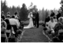
Ceremony Music & Sound