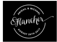
Custom Crafted Projected Wedding Monograms