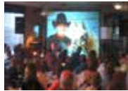
PhotoStory Multimedia Slide Show