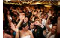
Reception Dance Music Awesome Light Show